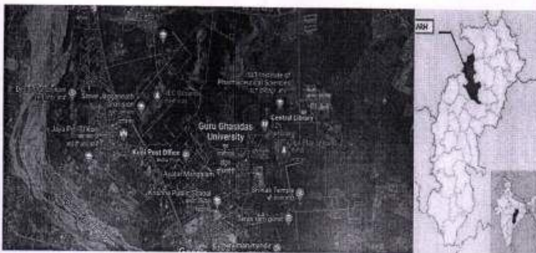
Fig 1: The Map of Guru Ghasidas Vishwavidyalaya campus

The topography of Guru Ghasidas Vishwavidyalaya campus is undulating with a wetland (lake) towards the centre that drains to the south eastern boundary. The water body is rain fed and has water almost throughout the year. The whole campus is interspersed with scattered trees at few places thus, making it a picturesque landscape suitable for a wide spectrum of flora and fauna. The Academic Departments and residential quarters/hostels have come up over the area which were highlands or in gradually filled lowlands. The present study revealed that the Guru Ghasidas Vishwavidyalaya campus has a total of 653.76 Acre of land. The GGV campus occupy an area of 491.93 acres under forest green area, 49.58 acres under wetland (Lake area), 6.77 acres under Botanical garden, 16.77 acres of playground. The large wetland is a home to a wide diversity of aquatic flora and fauna. It is a matter of concern that the wetland has been observed to be silted up and presently some of the area of the lake is under a thick cover of grass and aquatic weeds.